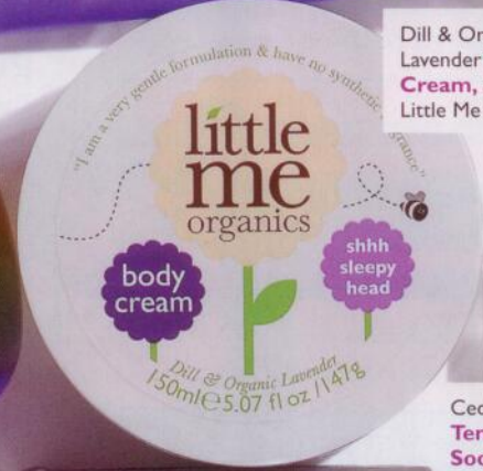
Dill & Organic Lavender Body Cream, £4.99, Little Me Organics