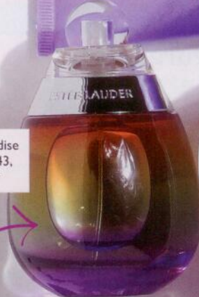
Beyond Paradise Perfume, £43, Estée Lauder