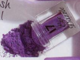
Eye Dazzle in Sweetness & Light, £3.99, 17 at Boots