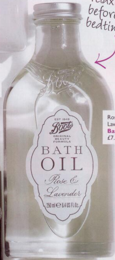
Rose & Lavender Bath Oil, £7.79, Boots