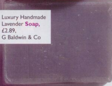
Luxury Handmade Lavender Soap, £2.89, G Baldwin & Co