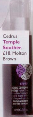
Cedrus Temple Soother, £18, Molton Brown